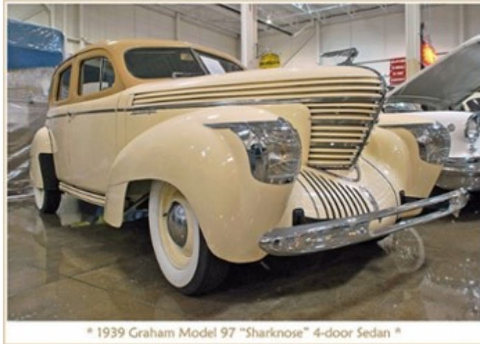
* 1939 Graham Model 97 "Sharknose" 4-door Sedan *

trendsetter design that just wasn't able to save the company.